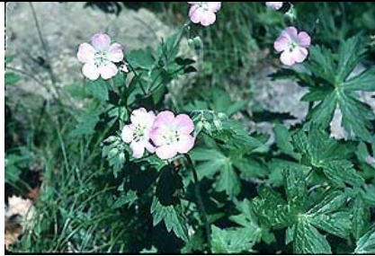
Wild geranium ( Geranium maculatum )