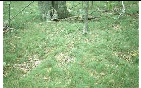
Pennsylvania sedge ( Carex pensylvanica )