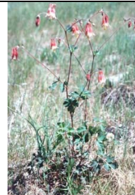
Columbine ( Aguilegia canadensis )