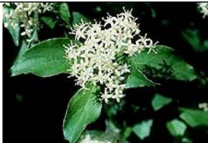
Gray dogwood ( Cornus racemosa )