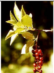
Chokecherry ( Prunus virginiana )