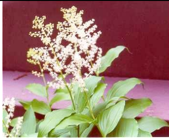
False Solomon's seal ( Smilacina racemosa )