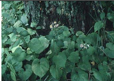
Big-leaf aster ( Aster macrophyllus )