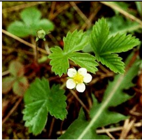
Woodland Strawberry ( Fragaria vesca )