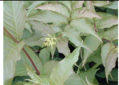
Dwarf bush honeysuckle ( Diervilla lonicera )