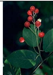
Service/Juneberry ( Amelanchier laevis )

Photo Source: "Wisconsin Botanical Information System" by the UW Madison Wisconsin State Herbarium