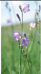
Harebell ( Campanula rotundifolia )